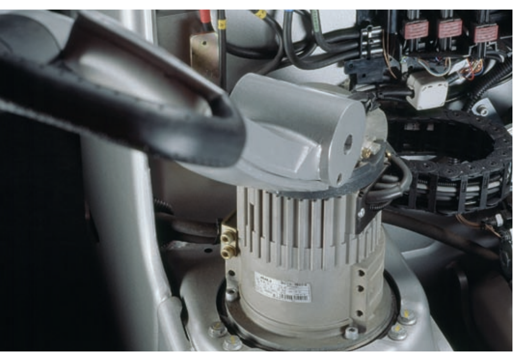
Integrated travel drive of a pallet truck

The industrial truck sector requires drive systems with high performance within the smallest space, which must operate as quietly as possible and also have a low maintenance requirement. The Schaeffler Group can set things in motion here. Because whether it's an electric motor or an internal combustion engine, whether it's a transmission or a hydraulic system – all these systems contain a variety of rolling and plain bearings.