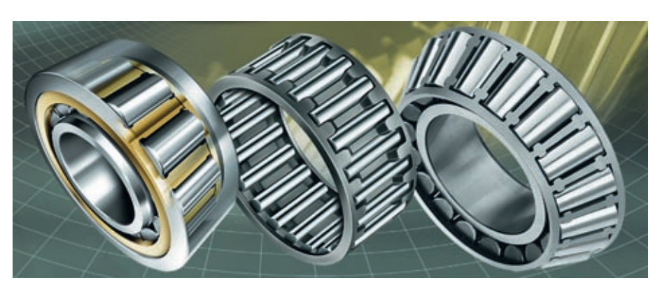
For applications in which accuracy and high speeds are required: Cage type bearings with cylindrical, needle or tapered rollers