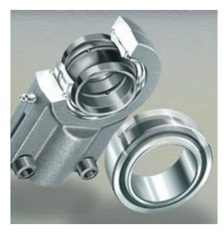
Requiring maintenance or maintenance-free: ELGES spherical plain bearings for lift mast connections or bearing supports

Due to the design of the rollers, it is possible to use a space-saving construction and minimize friction. We are able to cater for individual customer requirements for chain guide rollers, for example, by matching the outer profile to the form of the respective chain.