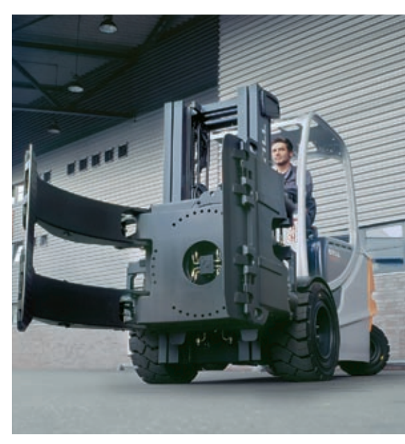
Attachments such as those for handling paper rolls are the applications for INA slewing rings

The lift mast is raised by chains and hydraulic cylinders. We offer the rollers required to guide the tension chain and the lift mast rollers in high grade materials.