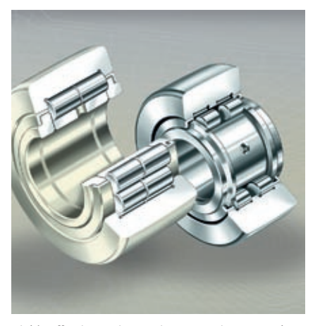
Highly effective anti-corrosion protection: INA yoke type track rollers, left with special coating Corrotect ^{\odot}