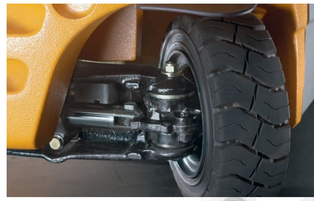
Tie rod: Maintenance-free solutions are also possible here

Our solution provides you with a means of increasing your cost-effectiveness. The idea: A forged unit with two maintenance-free spherical plain bearings. The advantages: