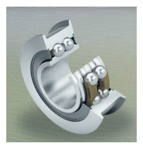
Various outer profiles possible: Here a chain guide roller with wheel flanges for chain guidance