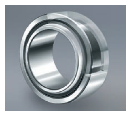
Maintenance-free for life: ELGES spherical plain bearing, e.g. for the tie rod in a double-pivot steering system