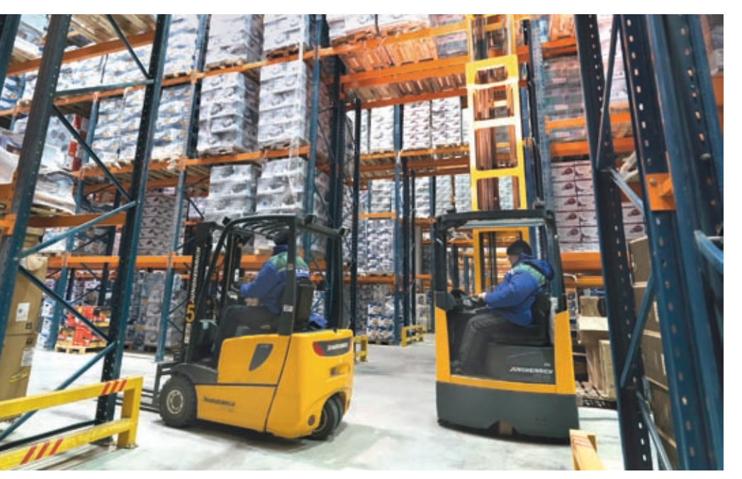
High load carrying capacity and low-maintenance – these requirements must be fulfilled by wheel bearings in industrial trucks. We offer cost-effective solutions for these bearings.