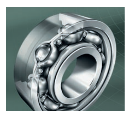
Generates economic benefits when used! Low-friction Generation C deep groove ball bearings save energy

A Generation C ball bearing is, so to speak, in energy efficiency class AAA, because it allows, for example, a reduction in the energy consumption of an electric motor. The new bearing generation in the FAG catalog range has around 35% less friction and runs significantly quieter compared to the previous design. The use of new Generation C bearings not only reduces the power loss, but also lowers noise levels. This can have a significant effect on the energy and environmental characteristics, especially for small forklift trucks.