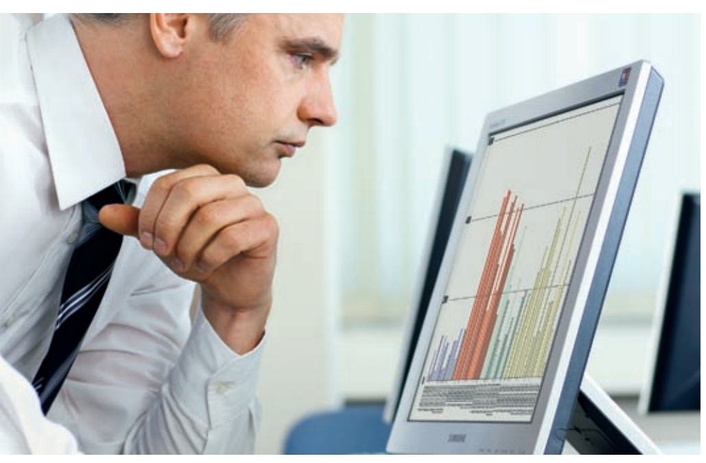
Research and development that serves the customer: Investigations for increasing the grease operating life – for reliable lubricants