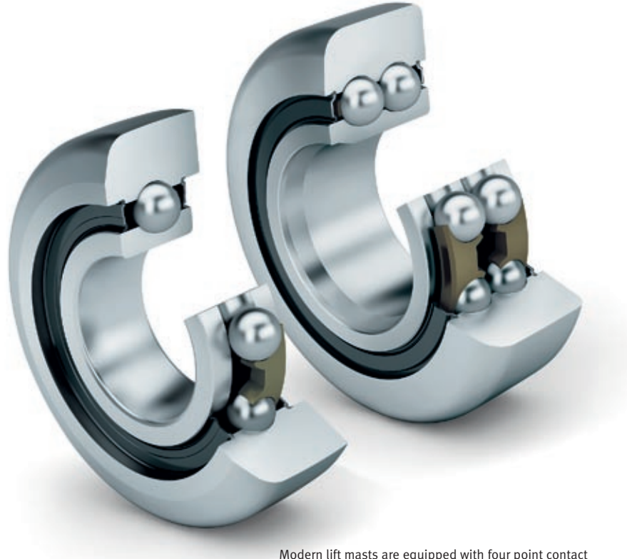
Modern lift masts are equipped with four point contact bearings and/or double row angular contact ball bearings

We offer various lift mast rollers based on ball bearings and bearings with cylindrical rollers for heavy-duty applications.