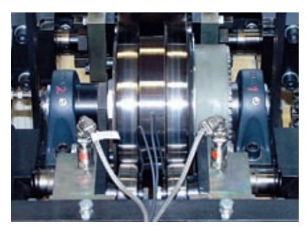
Lift mast roller test stand – an in-house development by Schaeffler Group Industrial