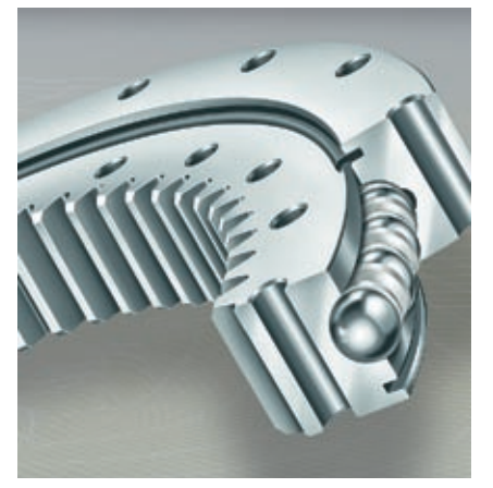
For more operational safety: Slewing ring with internal gear teeth e.g. for attachments