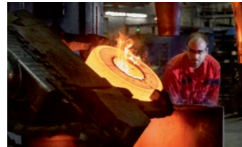
Metal production and processing