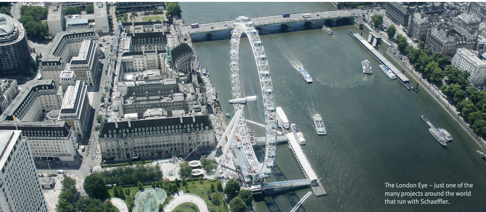
The London Eye – just one of the many projects around the world that run with Schaeffler.