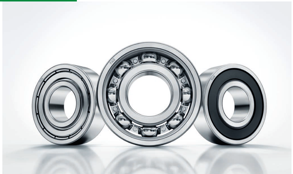
FAG Generation C Deep Groove Ball Bearings

Why pay more for quality when you don't have to?