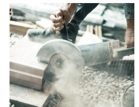
Dust in the wind. But not in the bearing.

In a workshop, dust and dirt are permitted just about anywhere. Except in the bearings inside the tools. Thanks to our innovative seal design, this can’t happen. FAG Generation C deep groove ball bearings are absolutely impermeable, so grease stays in and dust stays out.