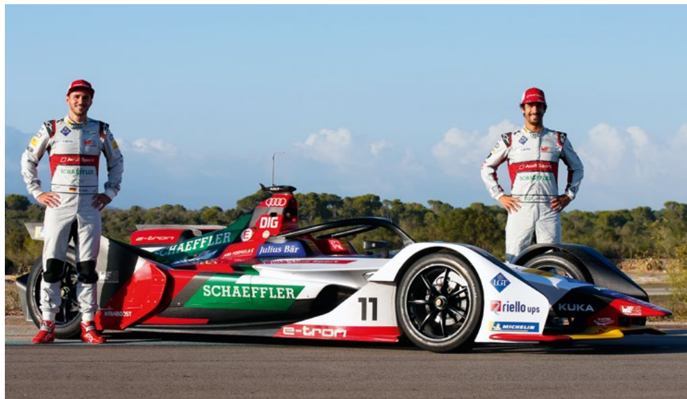
Daniel Abt and Lucas di Grassi are racing in Formula E with the newly developed Audi e-tron FE05

In season four of the all-electric racing series, the Audi e-tron FE04 was very often the most efficient car. The successor for 2018/2019 is the evolution of this success model. This is particularly true for the centerpiece of the Audi e-tron FE05: the powertrain. The motor-generator unit named Audi Schaeffler MGU03 was developed jointly by Audi and its technology partner Schaeffler. The main focus of the engineers was on making the package even more efficient than before and to further increase its energy efficiency. The successful outcome of the project: 95 percent of all the powertrain components are new, plus the engineers managed to reduce weight by ten percent.